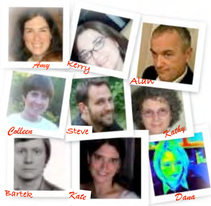
Some faces from the 7th floor of Robarts ... and on the SPOTDocs wiki