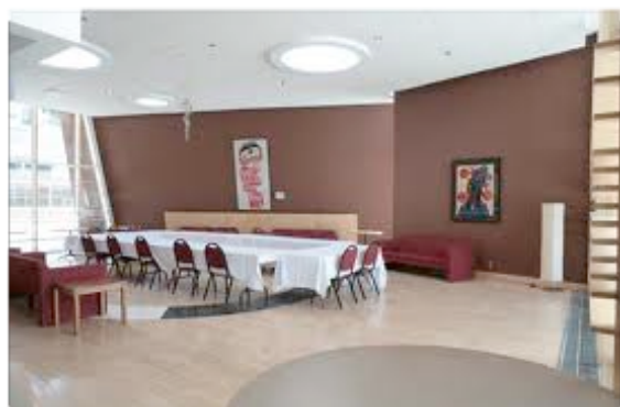
The Gathering Space meeting room at Trent's Gzowski College